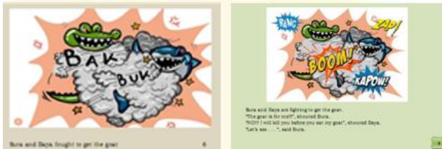
Fig 9: Before and after revision of language used on fighting

2. The use of language on fighting has already changed