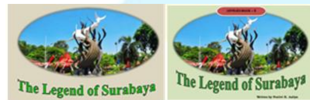
Fig 5: Before and after revision of book's cover