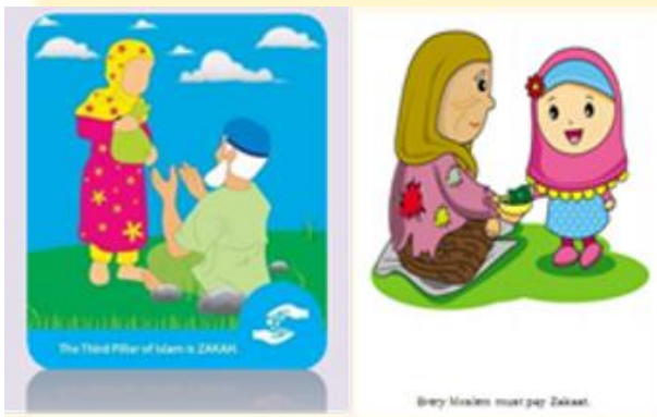
Fig 10: Before and after revision of unclear picture

3. The unclear picture has already changed into the best one