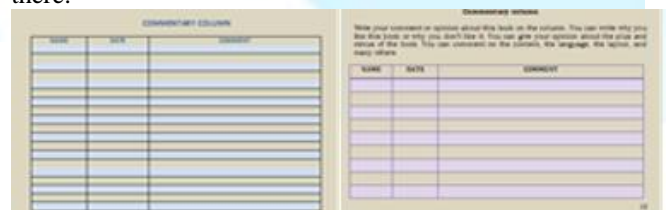
Fig 7: Before and after revision of commentary column