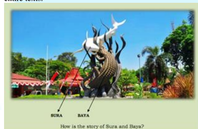
Fig 2: The example of good short-excerpt

The next aspect of content evaluation was about books' features. The first feature was short-excerpt that put on the first page before the reading text. The two evaluators agreed that short-excerpt could motivate students to read the whole text, but the second evaluator suggested creating short-excerpt in the form of question to make students more challenged to answer the question by reading the entire texts.