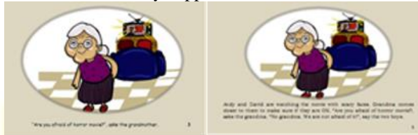
Fig 8: Before and after revision of adding details dialogue

1. Some dialogues have been added to the product to give details on what actually happened.