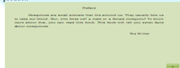
Fig 6: The preface on the revision book