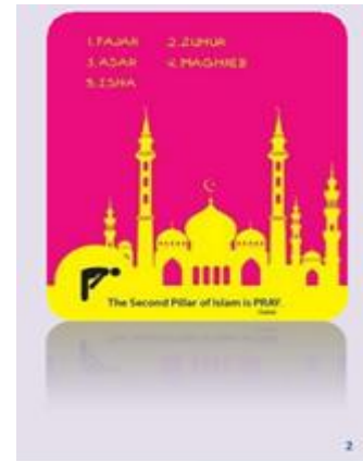
Fig 3: The layout of The 5 Pillars of Islam book before revision

Based on the validation result, the cover design and the arrangement of each text were interesting. However, some aspects that need improvement were font size and typing of the book The 5 Pillars of Islam. The font size on that book was quite small and the typing was unclear, so it was uneasy to read. The evaluators suggested strongly revising that book in term of layout.