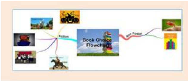
Fig 4: The books' choice flowchart before revision

Unfortunately, only 60% of students who agreed that flowchart could help them to find the just right book. This was possibly due to the ambiguous form of flowchart just like what the evaluators said.