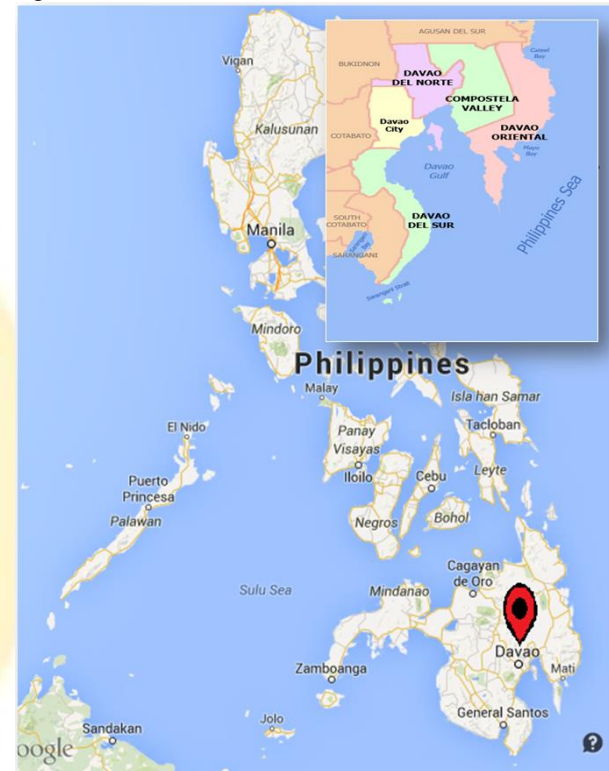
Figure 2.Support Philippine Map Highlighting Davao Region

The researcher employed the stratified random sampling technique using the Slovin's Formula in determining the exact number of respondents. Specifically, the elementary school teachers were the respondents of this study, which were taken among the selected elementary schools in Davao. The study was conducted within the school campuses of the selected elementary schools in Davao Region during the month of November 2015. The distribution of the respondents in terms of cities/municipalities with an overall population of 19, 881 and the overall sampling population based on Slovin's computation of 400. In Compostela Valley, out of 3, 259, 64 respondents were taken Based on Slovin 's computation or 16 percent; 108 were taken from Davao City out of 5,401 or 27 percent; 40 were chosen from Davao Del Norte out of 1,977 or 10 percent; 76 were taken from Davao Del Sur out of 3,682 or 19 percent; in Davao Oriental, out of 987, 20 were taken as respondents of the study; in Digos City, out 660, 12 were taken or 3 percent; in Igacos, out of 458, 8 respondents were taken equivalent to 2 percent; out of 1,865 in Mati, 36 were taken as respondents of the study; in Panabo City, 16 respondents were taken out of 704; and, in Tagum City, 20 respondents were taken out of 888. Data showed that majority of the respondents came from Davao City showing that the area is highly congested and urbanized.